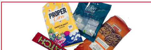
WRAPPERS AND PACKETS