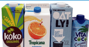
CARTONS AND TETRAPAK