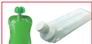
POUCHES AND TUBES