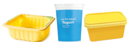
PLASTIC POTS AND TRAYS