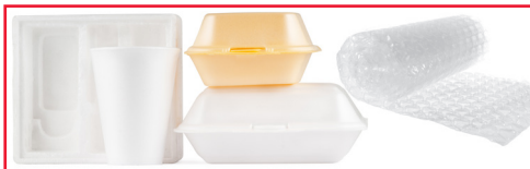
POLYSTYRENE AND BUBBLE WRAP