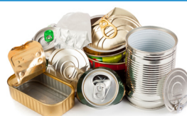
TINS, CANS AND FOIL