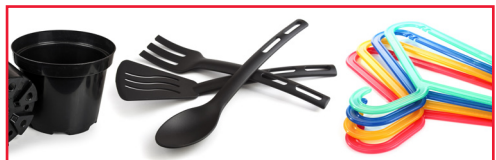
HARD PLASTIC ITEMS