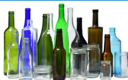
GLASS JARS AND BOTTLES