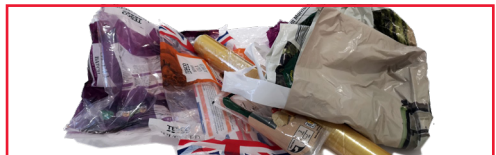
PLASTIC BAGS AND FILMS