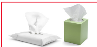
WIPES AND TISSUES